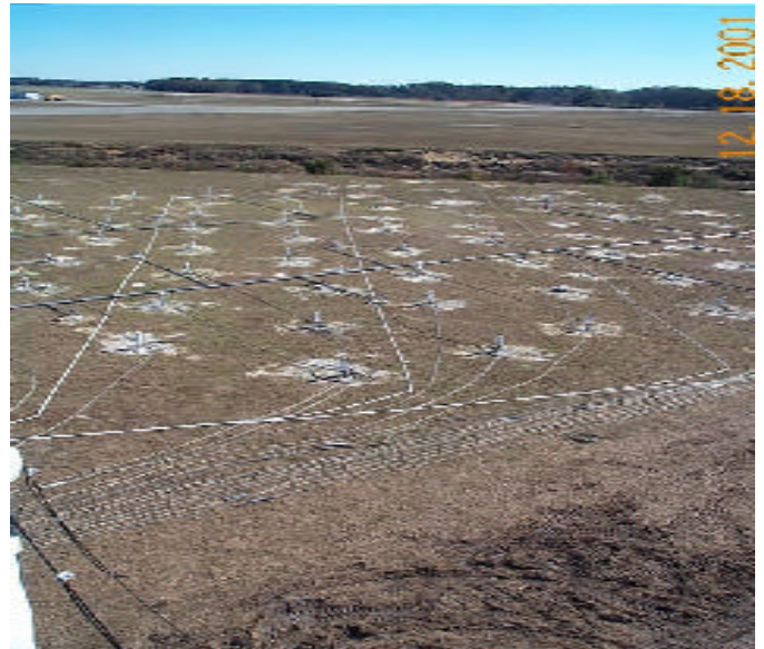
Bird's Eye View of Electrode Field

The total estimated area affected by the benzene plume covered 30,000 ft 2 . The LNAPL layer was up to two feet thick and covered an area of approximately 10,000 ft 2 . The contamination extended from 8 feet below grade surface (ft bgs) to 16 ft bgs. All told, the total volume of soil and groundwater requiring treatment was approximately 8,900 yd 3 . The subsurface soil mainly consisted of silty sand grading to sand with depth. Groundwater was typically encountered at 10 ft bgs.